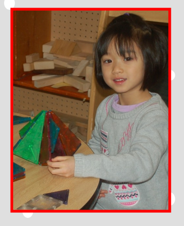
DONATE to the Fidelity House Capital Campaign!