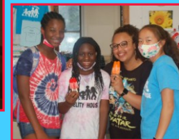
Option for Extended Care until 5:30 p.m.